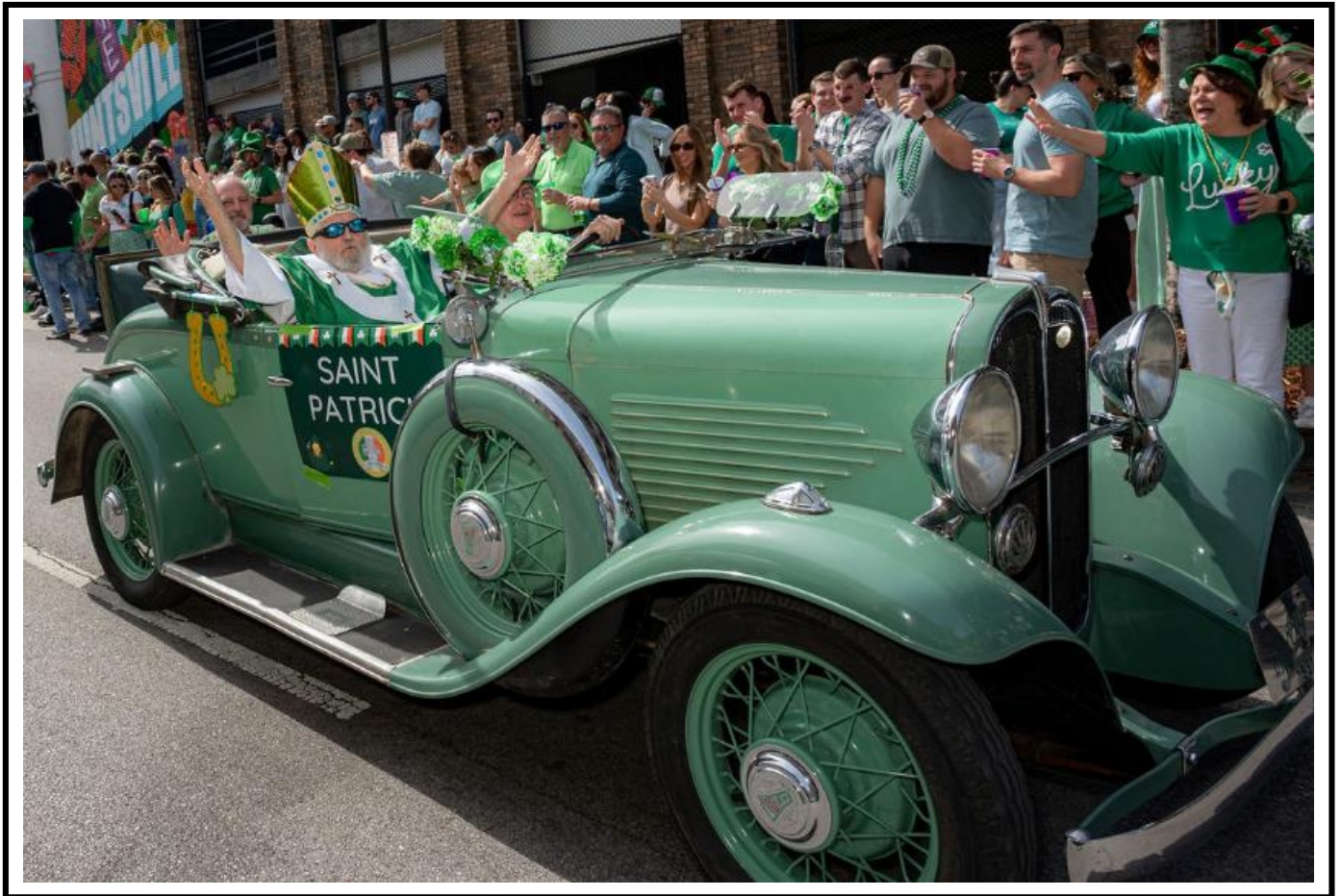
Saint Patrick / 1931 Willys 6 Model 97 Sport Roadster / Ed Hanish