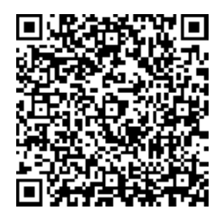
Marriott (Residence & Fairfield Inns)