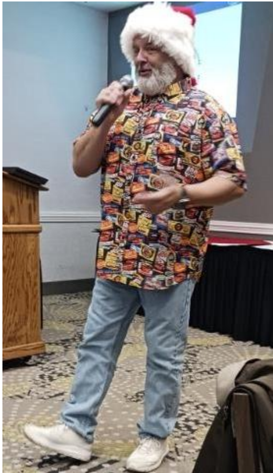
Santa has arrived!