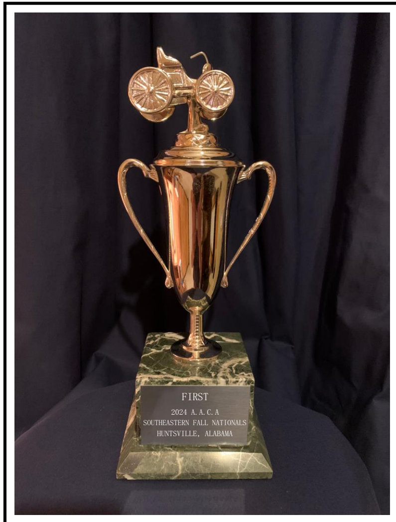
2024 AACA Rocket City Southeastern Fall Nationals Trophy