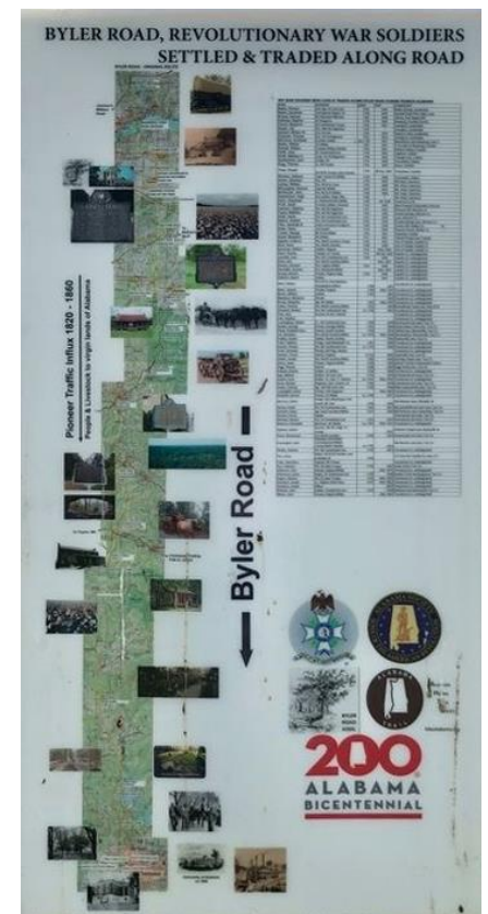
2024 state of Alabama Historic Markers