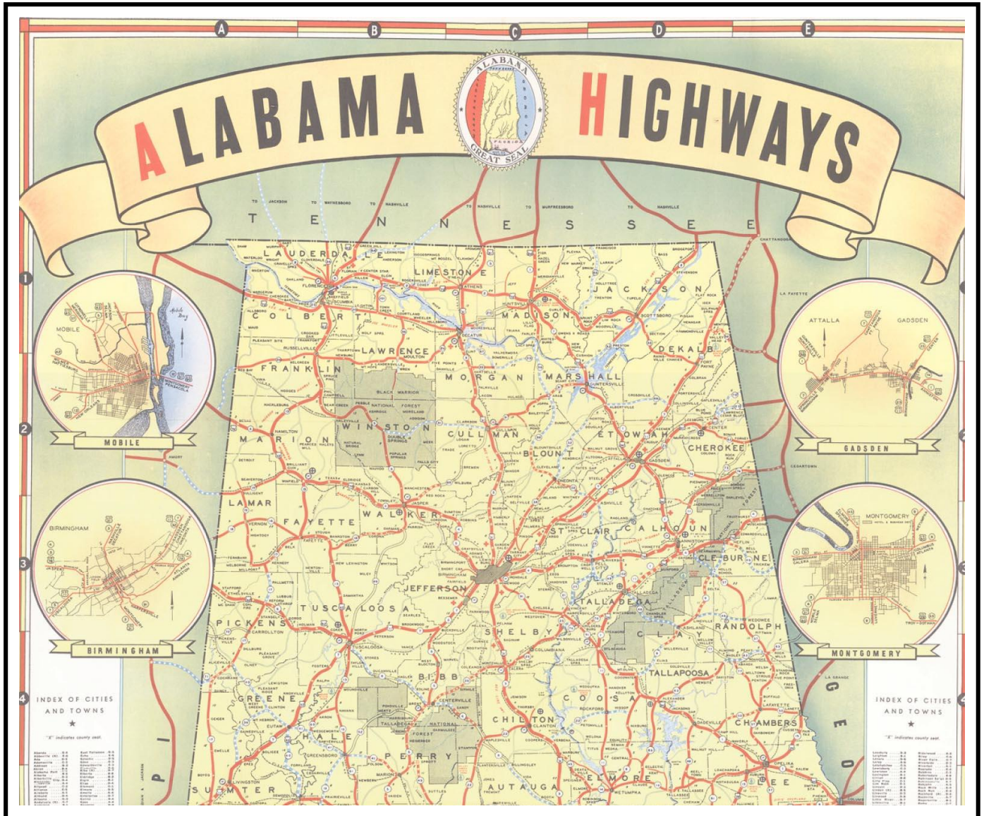
Official 1940 Alabama Highways Map