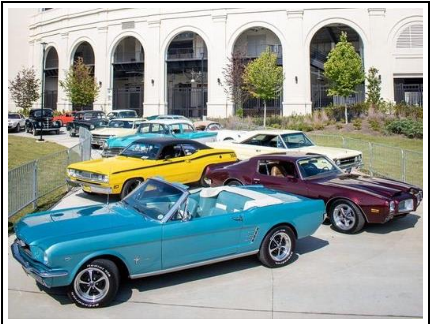
2023 North Alabama Region AACA Annual Car Show