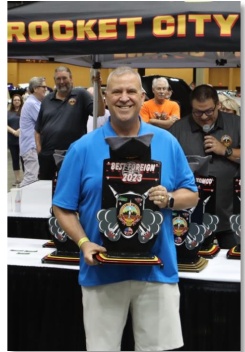
Best Foreign / David Poehlein