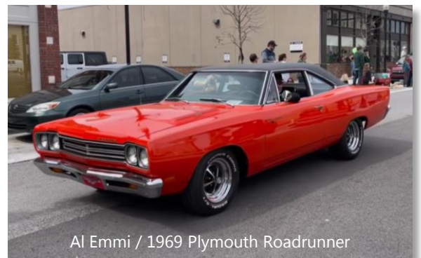
Al Emmi / 1969 Plymouth Roadrunner