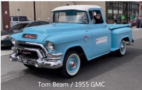
Tom Beam / 1955 GMC