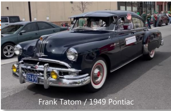
Frank Tatom / 1949 Pontiac