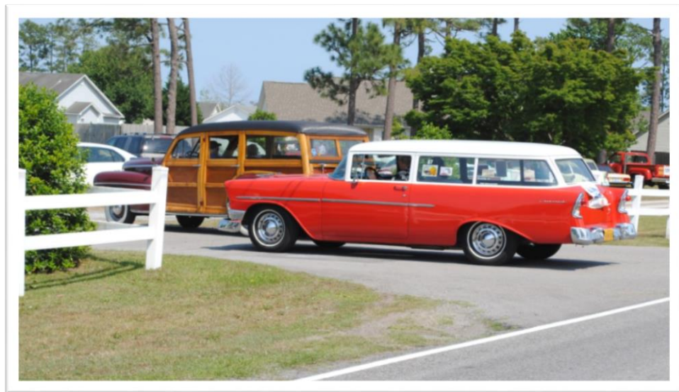
Headed to an Ice Cream Stop on the 2011 Southeastern Divisional Tour!

Lastly, and most importantly, AACA needs you to help promote our hobby and keep our events calendar strong and full. We have openings for events in 2017 and beyond. The AACA Board, the Judging committee, and my committee are here to help you succeed in promoting our hobby.