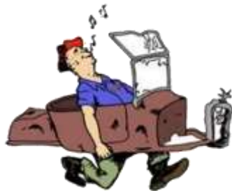
North Alabama Region

Membership in the Antique Automobile Club of America (AACA) is required. If you are not currently an AACA member, please visit the National AACA Membership site at https://aaca.org/about-membership/