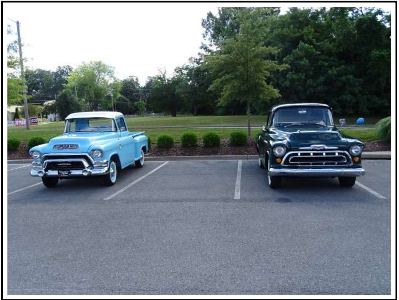
Tom Beam – 1955 GMC 100