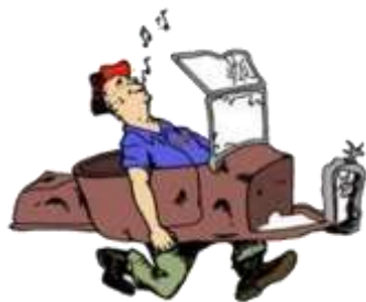
North Alabama Region

Membership in the Antique Automobile Club of America (AACA) is required. If you are not currently an AACA member, please visit the National AACA Membership site at https://aaca.org/about-membership/