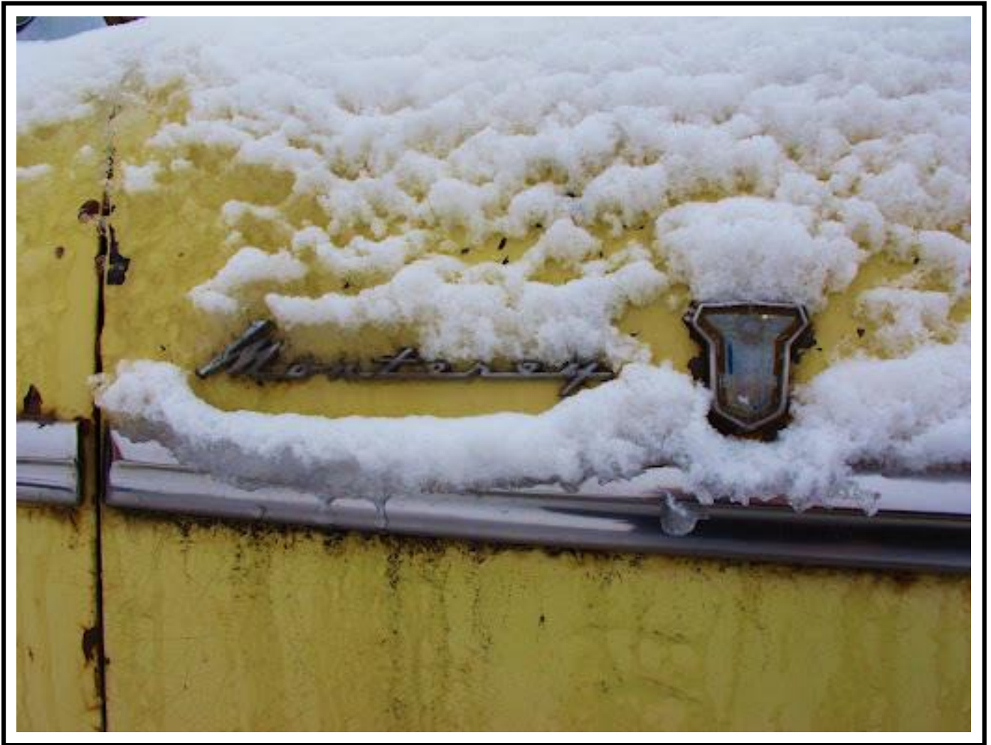
North Alabama Winter 2025